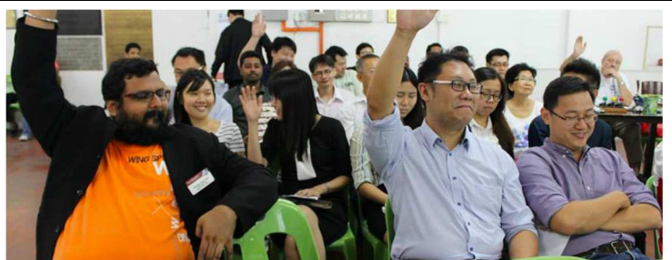
Attending Club Officers Training in Taiping, Perak.

At the same time I am able to inspire and encourage others to do the same. Toastmasters provided me the perfect platform to do all that!"