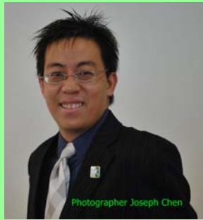
Photographer Joseph Chen