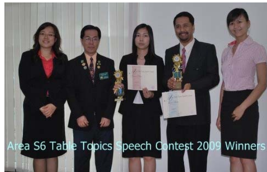
Area S6 Table Topics Speech Contest 2009 Winners